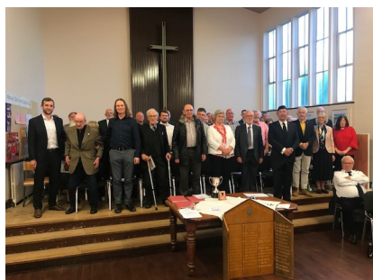
Former boys and officers at the Friday night display and awards. An excellent evening enjoyed by parents and members of the congregation